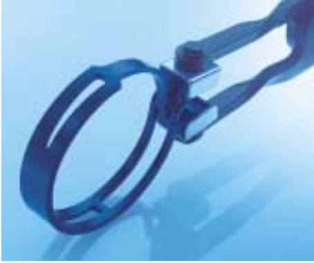
All Mubea hand pliers are constructed in the same way