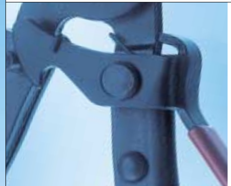
The locking lever